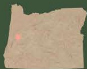
Made in Eugene, Oregon

AZOMITE ® is a natural mineral product mined in central Utah. This unique deposit was formed when an ancient volcano erupted and its ash settled into a prehistoric seabed creating a complex mineral composition. AZOMITE provides essential minerals key to green growth and proper stem and fruit development. This powder grade is ideal for direct application or for blending with other fertilizer materials, amendments, composts or manures to help meet plant nutritional needs.