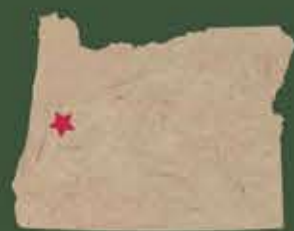
Made in Eugene, Oregon