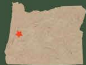
Made In Eugene, Oregon

Bio-Live is a unique starter and transplant fertilizer featuring a premium blend of marine byproducts infused with a diverse mixture of beneficial microorganisms. Select mycorrhizal fungi and bacterial species rapidly colonize the rhizosphere and surrounding soil to improve resource utilization and enhance nutrient uptake. Ideal for all plant types, Bio-Live provides the nutrients your plants need for expansive root systems, heavy crop yields and superior flowers, fruits, herbs and vegetables.