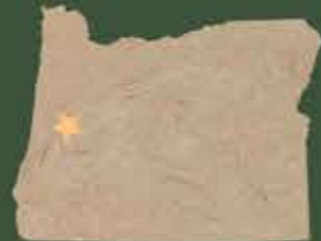
Made in Eugene, Oregon

Rose & Flower Mix supplies your favorite roses, bulbs, annuals and perennials with the nutrients they need for vigorous growth and sensational flowers. Tantalizing tea roses, magnificent marigolds, petite petunias, and tumescent tulips will all benefit from a good dose of Rose & Flower Mix . Onions and garlic love it too! Apply Down To Earth® Rose & Flower Mix at planting and throughout the season for a vibrant and colorful garden.