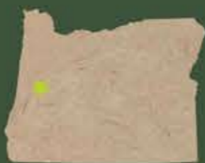
Made in Eugene, Oregon

Greenstone Metabasalt originates from basalt subjected to great heat and pressure over millions of years. Its naturally green color distinguishes it from unaltered basalts and comes from the presence of various minerals that were formed by these metamorphic forces. It is an excellent source of the valuable plant nutrients calcium, magnesium and iron and can be used for fortifying garden soils with these important mineral elements. Greenstone is ideal for direct application to soils or combining with other natural fertilizers, composts and soil amendments.