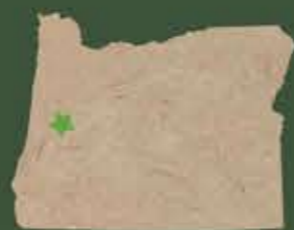
Made in Eugene, Oregon

Bio-Turf is an entirely natural granular lawn fertilizer designed to provide a slow, steady release of nutrients and encourage deep root development to help reduce watering requirements. Bio-Turf's nitrogen-rich formula boosts early season growth while its extra potassium reduces seasonal stress due to temperature change and drought. Bio-Turf is also ideal for heavy feeding garden vegetables like corn, tomatoes and leafy greens.