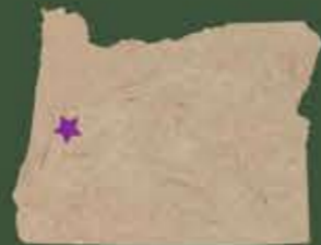
Made in Eugene, Oregon

Feather Meal is derived from hydrolyzed, dried and ground poultry feathers and is an all natural source of slow release nitrogen. It is perfect for heavy feeders and long season crops such as corn, tomatoes and fall harvested vegetables. Feather Meal should be incorporated into soils before planting, or side dressed throughout the growing season to provide a steady release of nitrogen, necessary for optimum plant growth. Nitrogen is essential for all types of growing plants, and an adequate seasonal supply ensures plenty of shoots, flowers, fruits and vegetables.