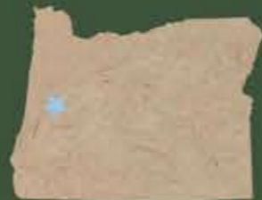
Made in Eugene, Oregon

Bat Guano is the undisputed champion of all natural fertilizer. This nitrogen-rich Bat Guano also provides essential phosphorus and potash for vigorous vegetative growth and prolific fruit and flower development. Bat Guano is highly effective mixed into soils, applied as a side dress or steeped to make a potent guano tea or foliar spray.