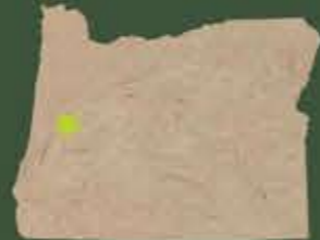
Made in Eugene, Oregon

Palm Tree is specially formulated to feed all varieties of palms and cycads with the essential macro and micronutrients they need to thrive in outdoor spaces. Whether in tropical or subtropical landscapes, palms add a regal touch and are unparalleled at transforming ordinary backyards into your own small piece of paradise. From the initial selection and design planning, to the planting, watering and fertilization, palms of all species need care and attention to ensure success. Feeding two to three times per season can help make sure that their nutritional needs are being met and prevent fronds from yellowing or curling. Palms can be an attractive gardening solution for adding shade and curb appeal; use Down To Earth Palm Tree fertilizer for the ultimate results for your tropical beauties.