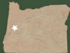
Made in Eugene, Oregon

Langbeinite is a naturally mined crystalline mineral that supplies three vital plant nutrients — potassium, magnesium and sulfur — all in the water-soluble sulfate form. Its neutral pH does not alter soil acidity and its maximum chlorine content is less than 3.0 percent, minimizing the potential for fertilizer “burn.” It is widely used on sensitive vegetables and fruit crops that require high fertilization rates but do not tolerate high levels of chlorine or soluble salts. This standard-grade Langbeinite has a typical SGN of 95 and is an excellent source of readily available potassium, magnesium and sulfur.