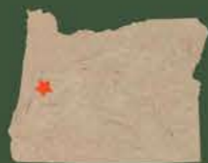
Made in Eugene, Oregon